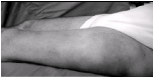
Fig1. Soft Tissue Swelling on the Proximal & lateral Aspect of Left Thigh

cases of all types of tuberculosis, an incidence of 0.015 per cent. Hence, as such isolated primary skeletal tuberculosis without any associated involvement of the adjacent bone or viscera is considered only a diagnosis of exclusion over a soft tissue tumour or a pyogenic abscess. It is of interest to note that most of the reported cases have been described frequently in association with immunodeficient individuals as in HIV infected patients, renal failure patients, patients on chemotherapy or corticosteroid and chronic drug abusers (3,10,11). A few reports have indicated that primary tuberculosis in muscle may be transmitted by direct inoculation with contaminated needles and syringes (12).